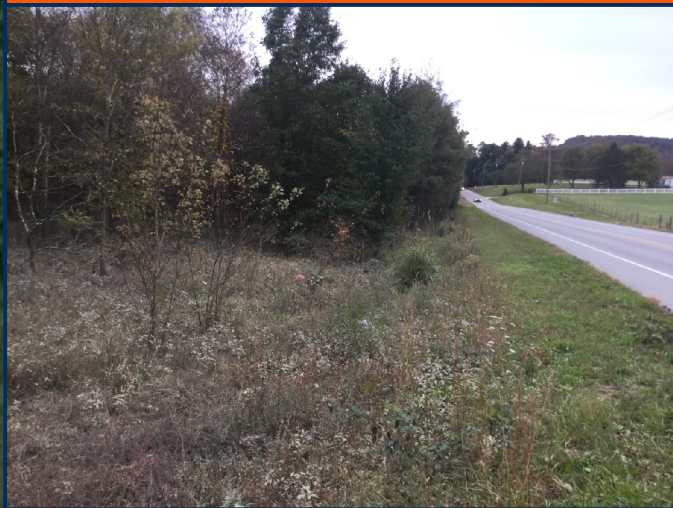
2 - Potential Violation