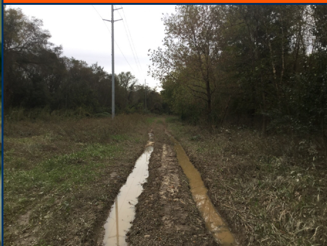
3 - ATV Tracks