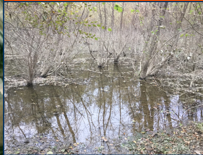
4 - Site View